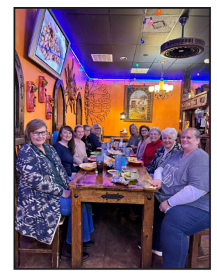
Beta Rho members gathered at a local restaurant on Saturday, January 27, 2024 for fun and fellowship.

the chapter about some of the challenges facing the teachers and students at his school.