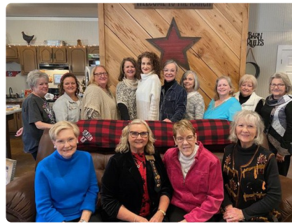
Beta Sigma Chapter awards classroom grants