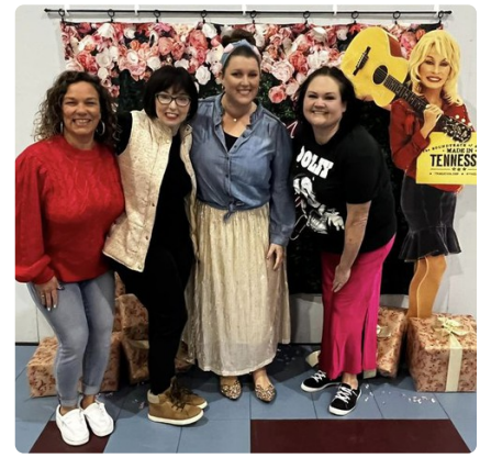
Lambda Chapter celebrates Dolly Parton and the Imagination Library